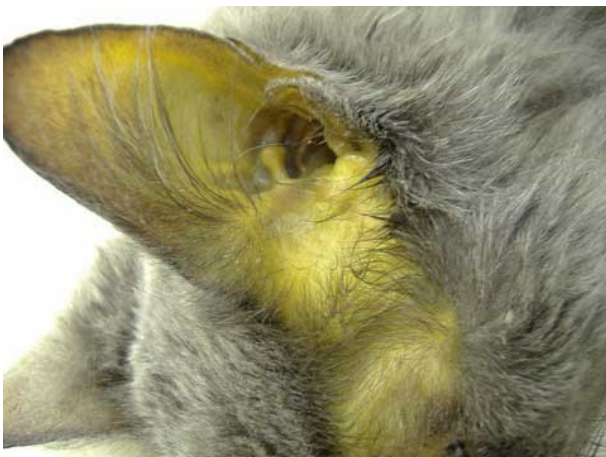
Jaundice of the skin in a cat infected with Cytauxzoon felis

Infected cats show signs 1 to 3 weeks after being bitten by an infected tick. A cat may be infected even if you don't see a tick on the animal, because the tick may have already fed and dropped off the cat before the animal starts showing signs of the disease. Cats become extremely ill when infected—the organism infects red blood cells, liver, lung, spleen and lymph nodes. The signs of disease include sudden listlessness, loss of appetite, anemia, difficulty breathing, high fever and jaundice—yellow coloring of skin, gums and the whites of eyes. Most cats die in less than 14 days from the time symptoms start.